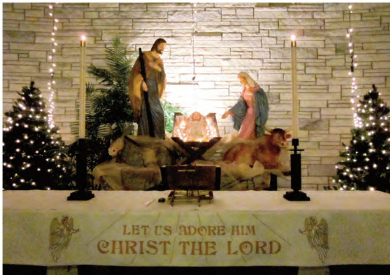
Christmas Eve at Trinity—a beautiful place to worship the King!